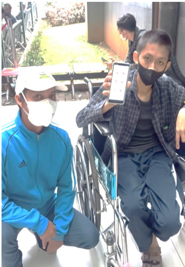
A still of community representative counselling a person affected by TB through LaporTBC powered by OneImpact

During the period January-May 2024, POP TB Indonesia worked closely with TB program implementers (health offices, SR/SSR, survivor organizations, CSOs) in each intervention area to expand the socialization/ promotion of LaporTBC powered by OneImpact. A total of 26 collaboration forums were organized with over 1,152 participants. Through this collaboration model the idea is to increase the utilization of CLM data in Indonesia.